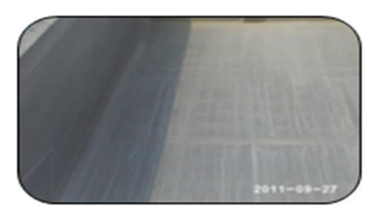
Load compartment clean-swept

loads. To ensure this. the vehicle's entire load compartment must be checked before every new consignment is loaded.